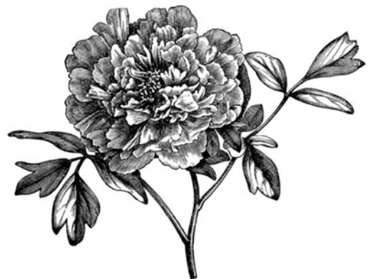
FIG. 4. FLOWERING BRANCH OF PÆONIA MOUTAN.